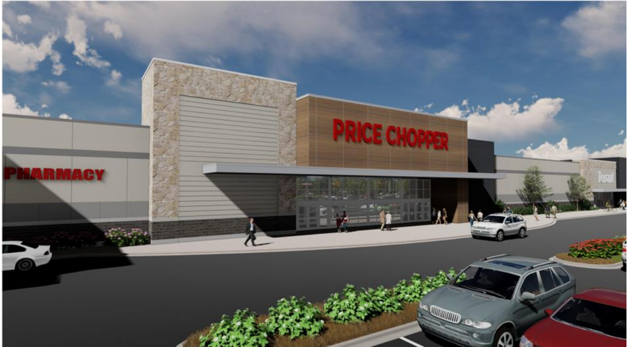
EXHIBIT E ARCHITECTURAL RENDERINGS