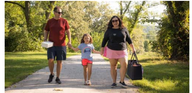
Social Media Influencers Touring Independence Following City & County COVID-19 Guidelines