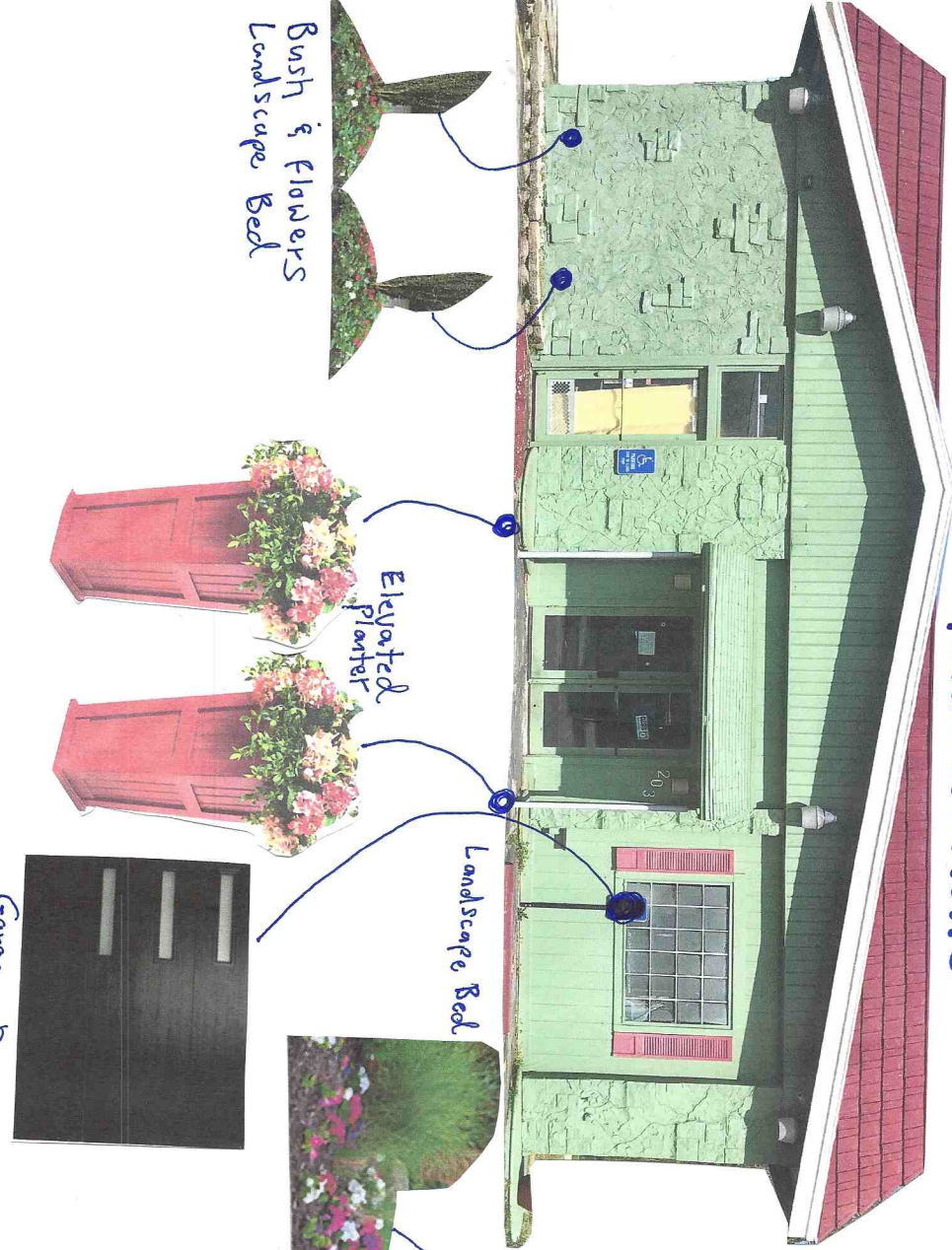
Bush & Flowers Landscape Bed