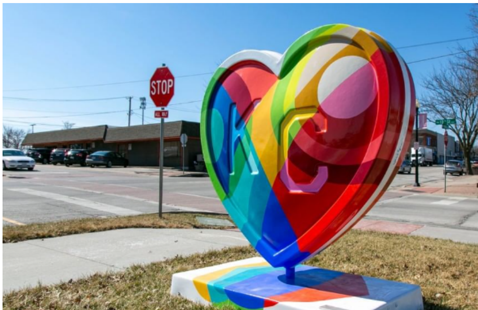
"Connected Heart" by Shelly Pinto displayed at 10th & Main in Blue Springs

These on-scene interventions help connect people in crisis with mental health services and prevent unnecessary arrests, emergency room visits and future police calls for service. ReDiscover recently identified additional funds to expand the program in Grandview and Raytown. The current federal grant expires in 2023, and the partnership is working to pursue future sources of funding to sustain and expand the program.