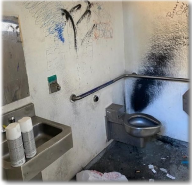
Graffiti and vandalism continue to keep Park Services crews busy. In addition, crews completed 48 unhouses clean-ups in park property.