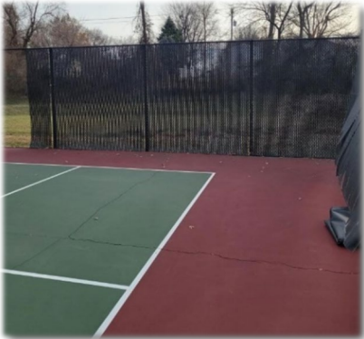
Wind screens were replaced at the Blackburn pickleball courts.