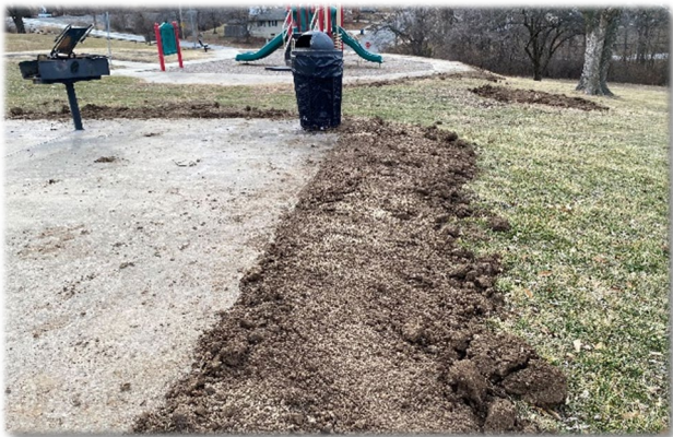
Grading and dirt work was necessary to eliminate tripping hazards at several parks and trails.