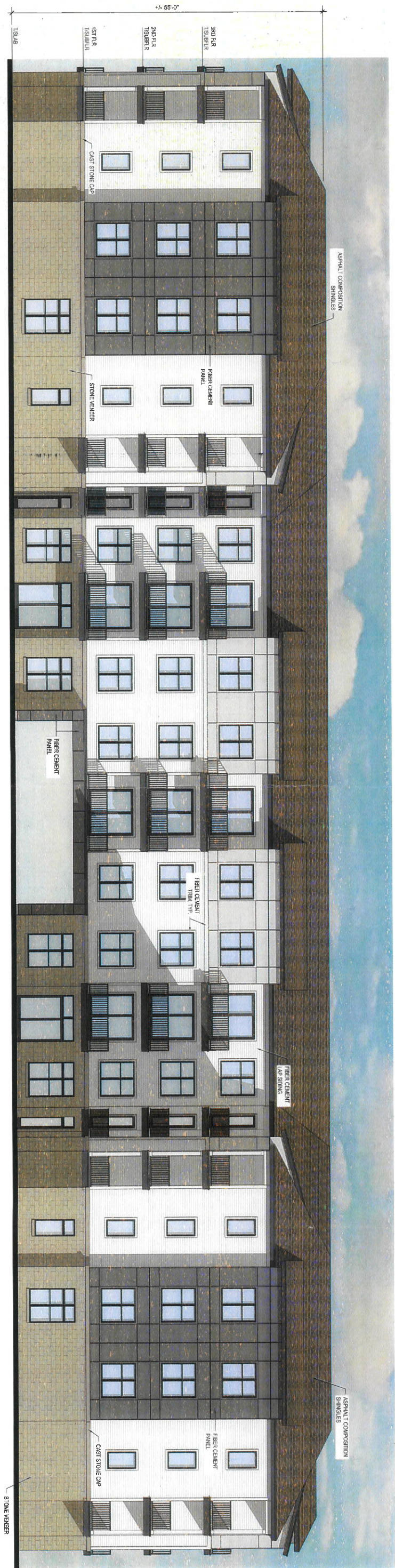
1 1/8" = 1'-0" EXTERIOR ELEVATION BUILDING B REAR ELEVATION