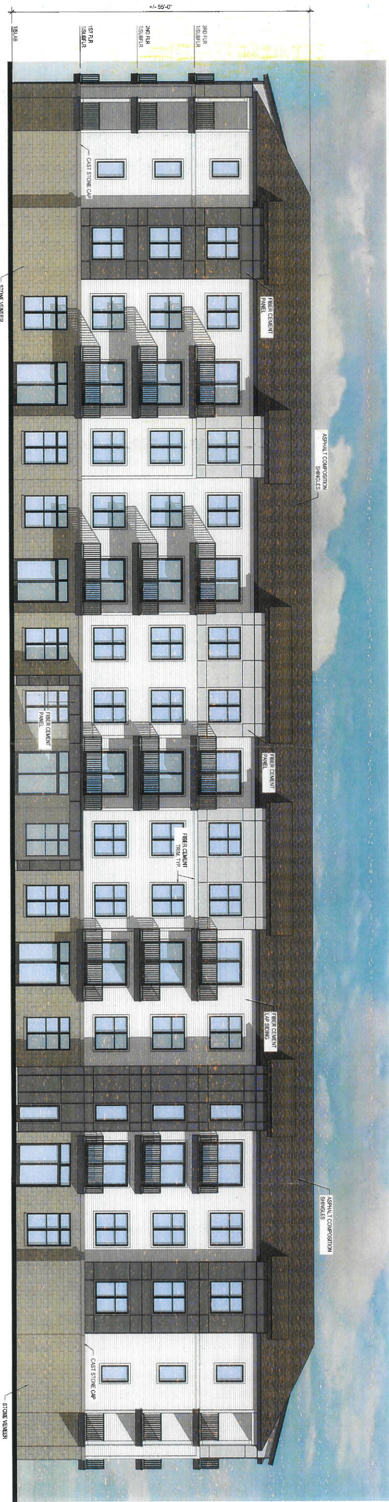
1 1/8" = 1'-0" EXTERIOR ELEVATION BUILDING C REAR ELEVATION