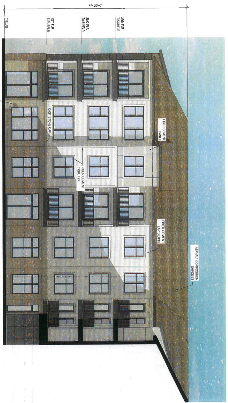
2 1/8" = 1'-0" EXTERIOR ELEVATION BUILDING B COURTYARD ELEVATION