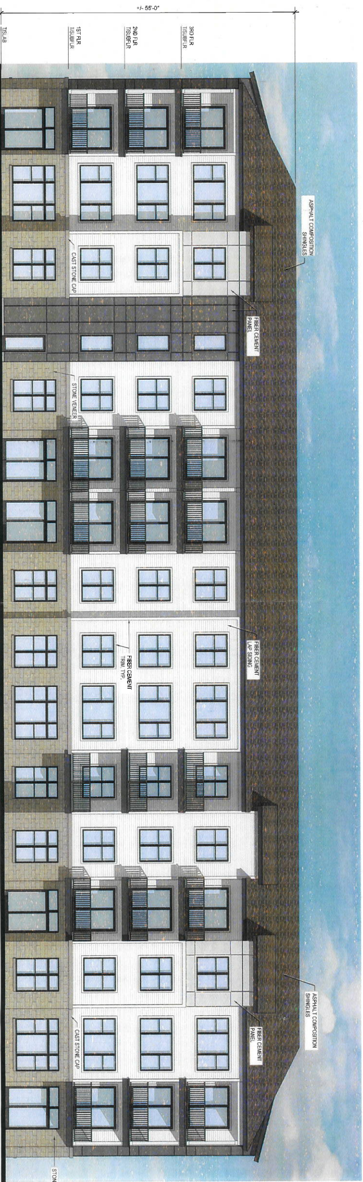
EXTERIOR ELEVATION BUILDING A REAR ELEVATION 1 1/8" = 1'-0"