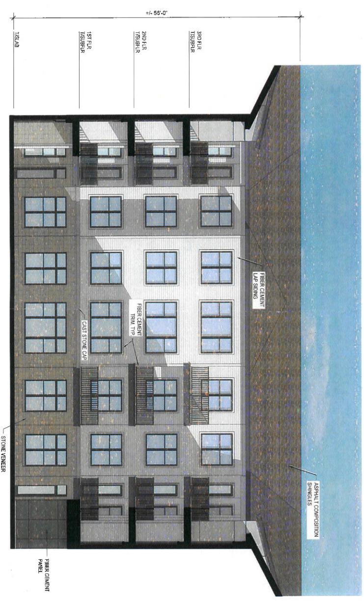
1 1/8" = 1'-0" EXTERIOR ELEVATION BUILDING C COURTYARD ELEVATION