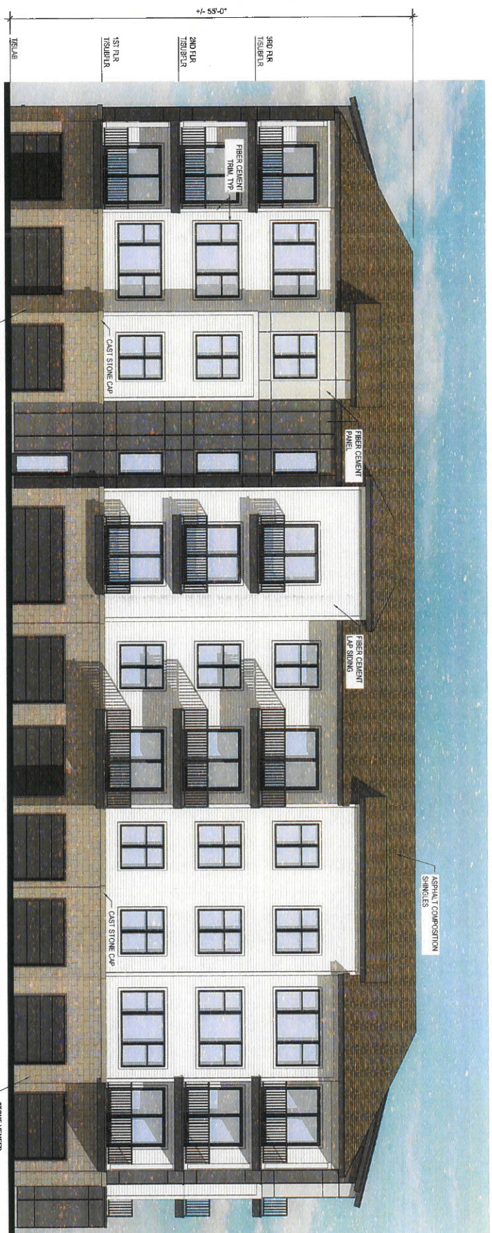
2 1/8" = 1'-0" EXTERIOR ELEVATION BUILDING B LEFT ELEVATION