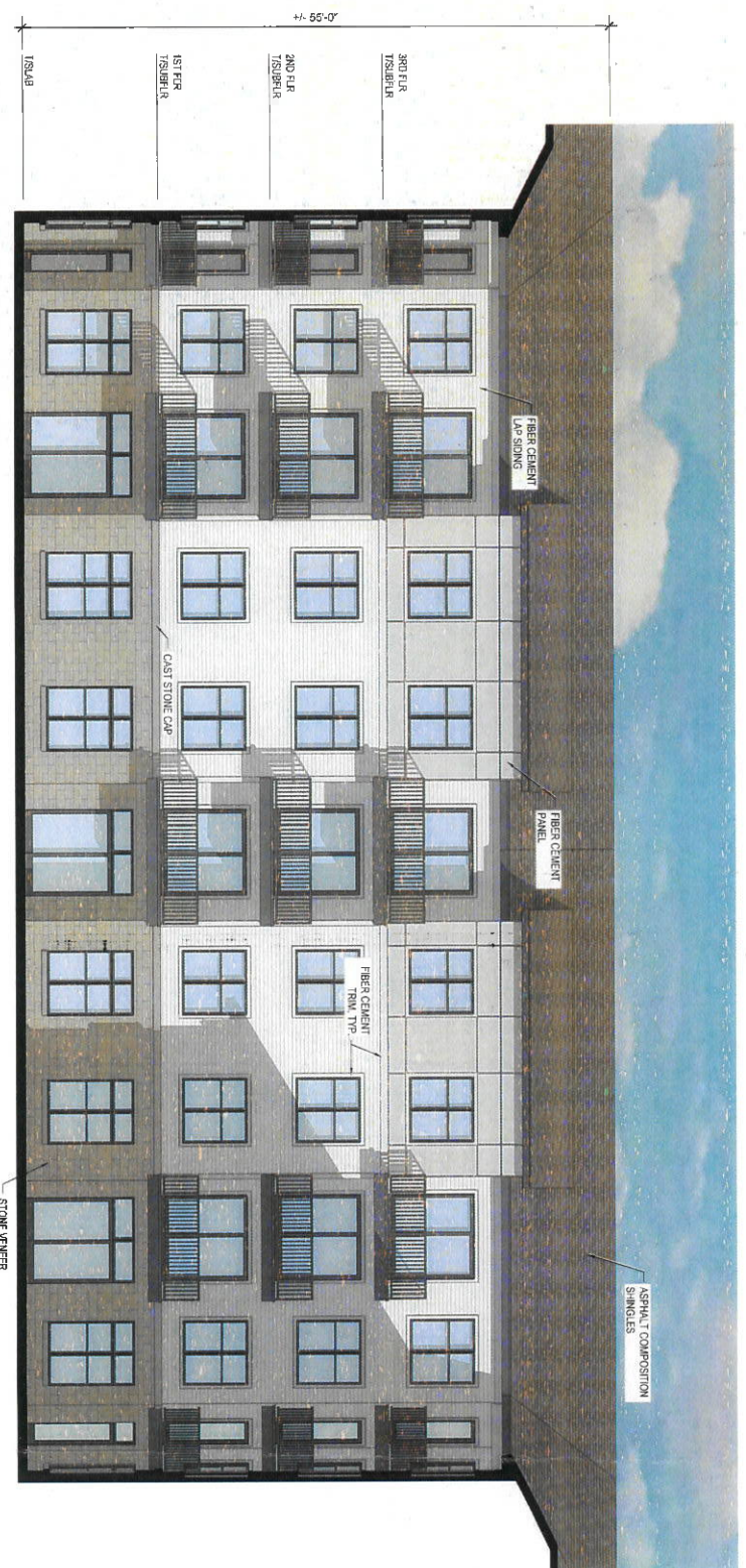
2 1/8" = 1'-0" EXTERIOR ELEVATION BUILDING C COURTYARD ELEVATION