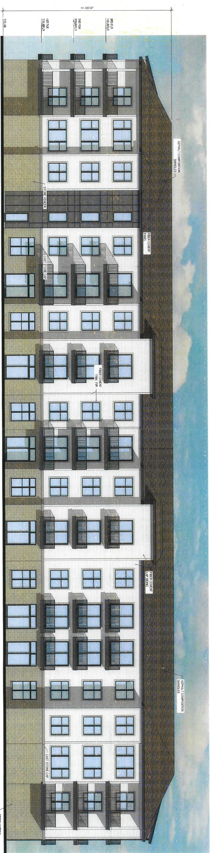
1 1/8" = 1'-0" EXTERIOR ELEVATION BUILDING C FRONT ELEVATION