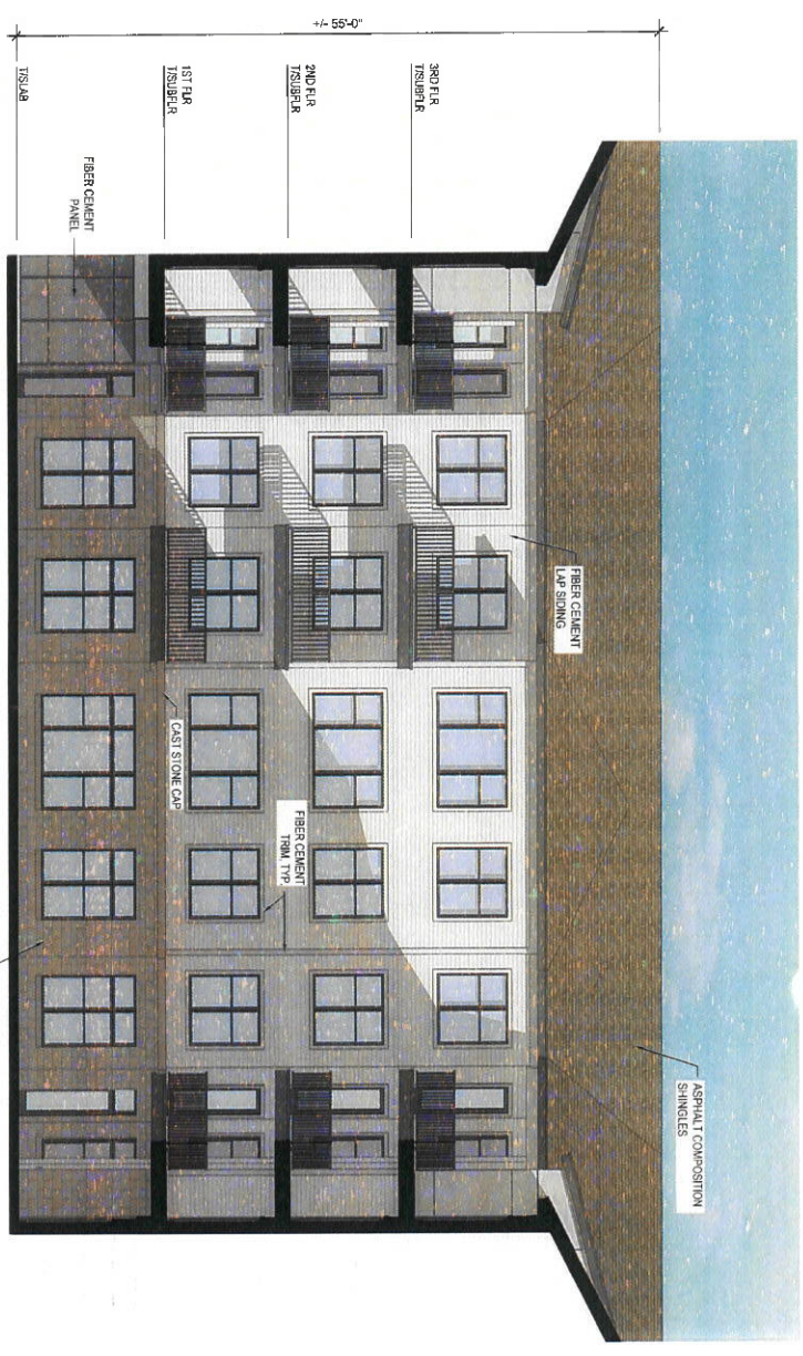
3 1/8" = 1'-0" EXTERIOR ELEVATION BUILDING C COURTYARD ELEVATION