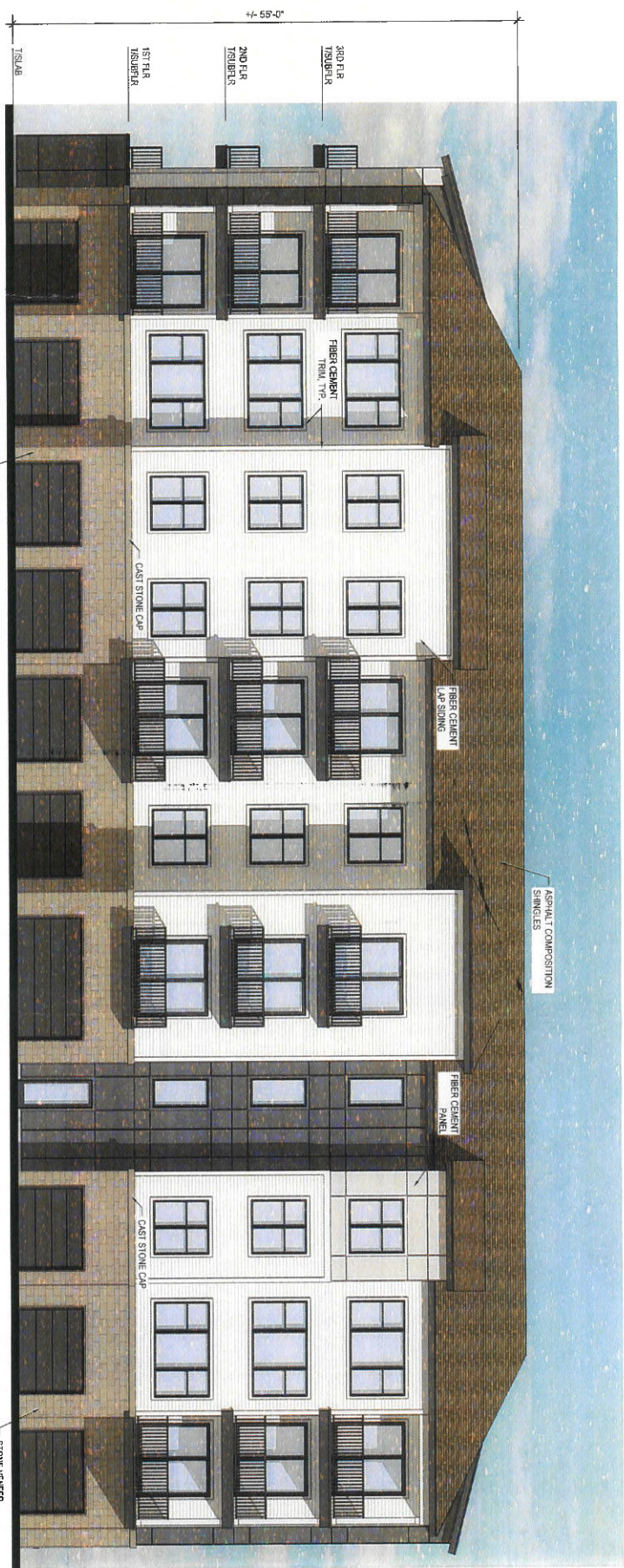
2 1/8" = 1'-0" EXTERIOR ELEVATION BUILDING B RIGHT ELEVATION