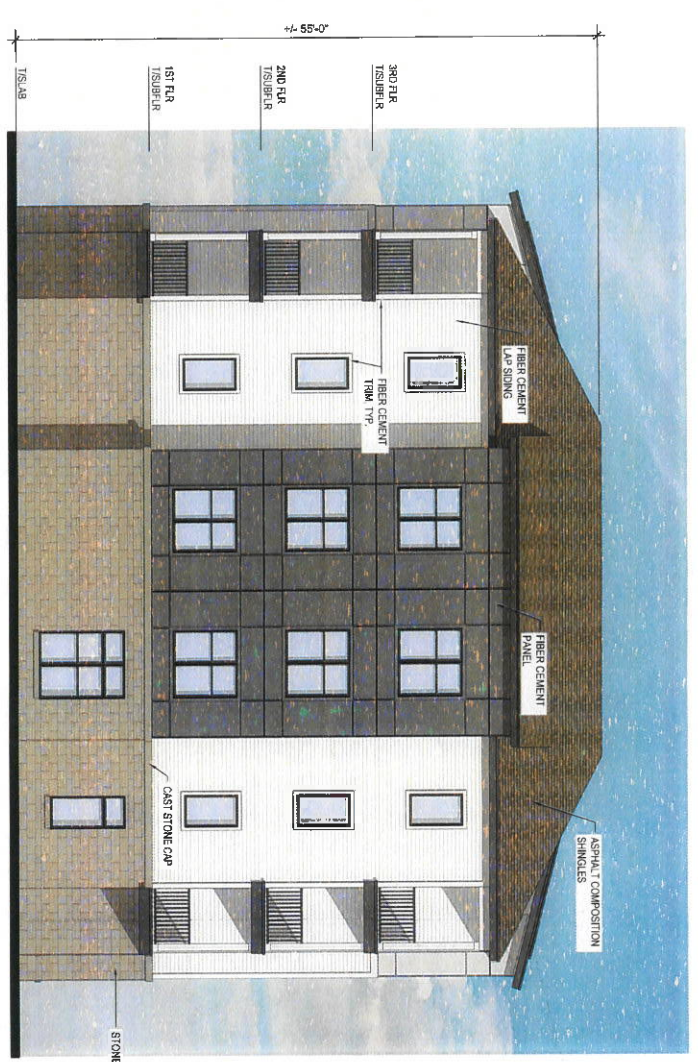
EXTERIOR ELEVATION BUILDING A RIGHT ELEVATION 2 1/8" = 1'-0"