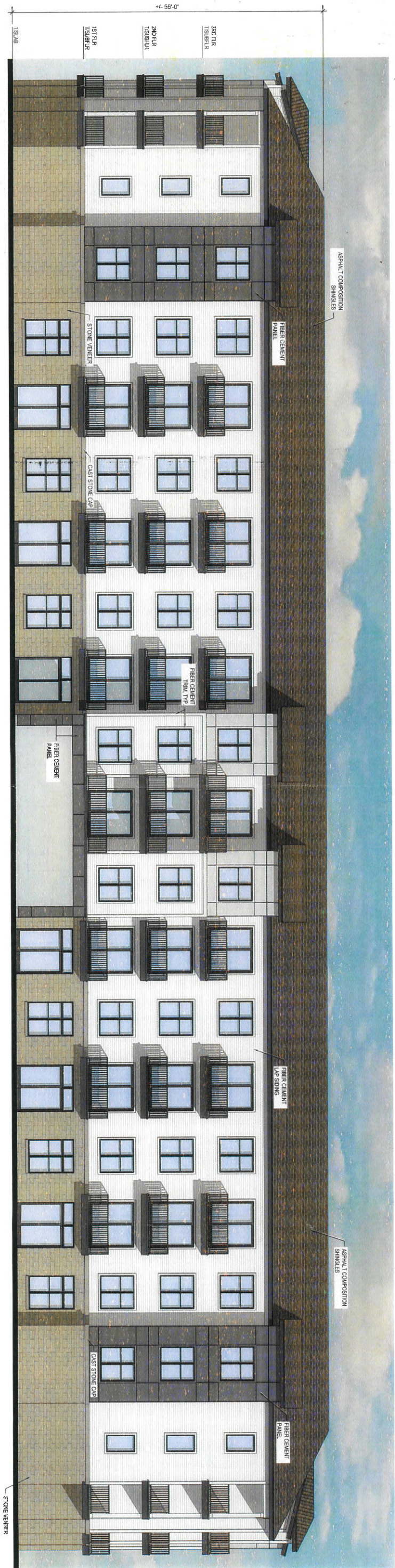
1 1/8" = 1'-0" EXTERIOR ELEVATION BUILDING B FRONT ELEVATION