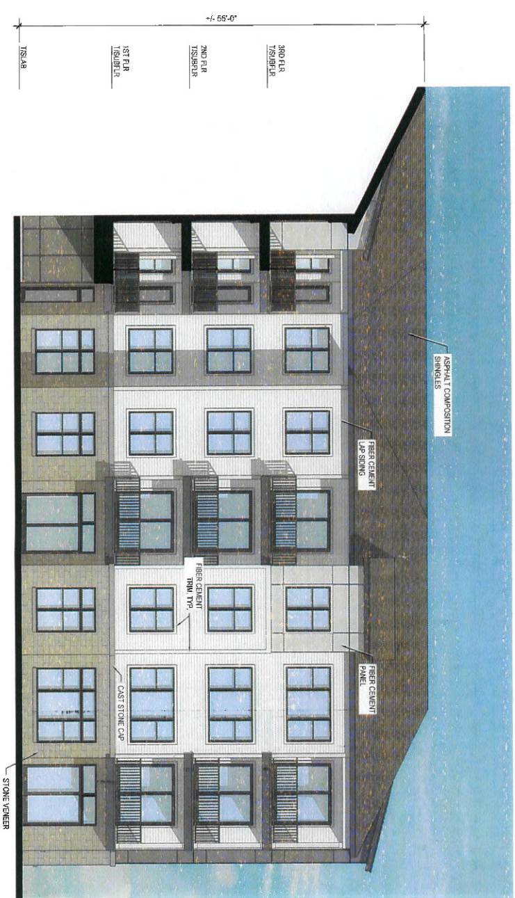
1 1/8" = 1'-0" EXTERIOR ELEVATION BUILDING B COURTYARD ELEVATION