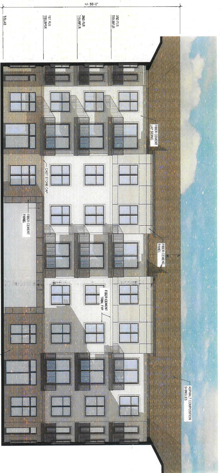
4 1/8" = 1'-0" EXTERIOR ELEVATION BUILDING C COURTYARD ELEVATION