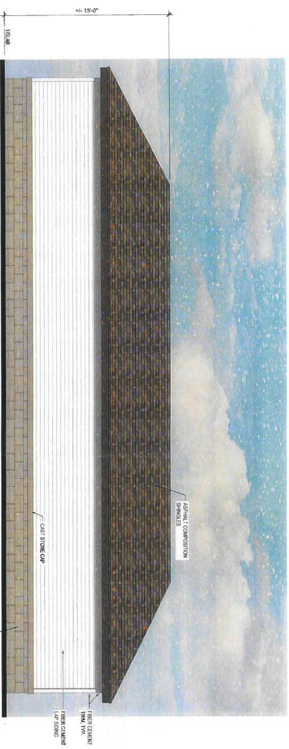
3 1/4" = 1'-0" EXTERIOR ELEVATION DETACHED GARAGE REAR ELEVATION