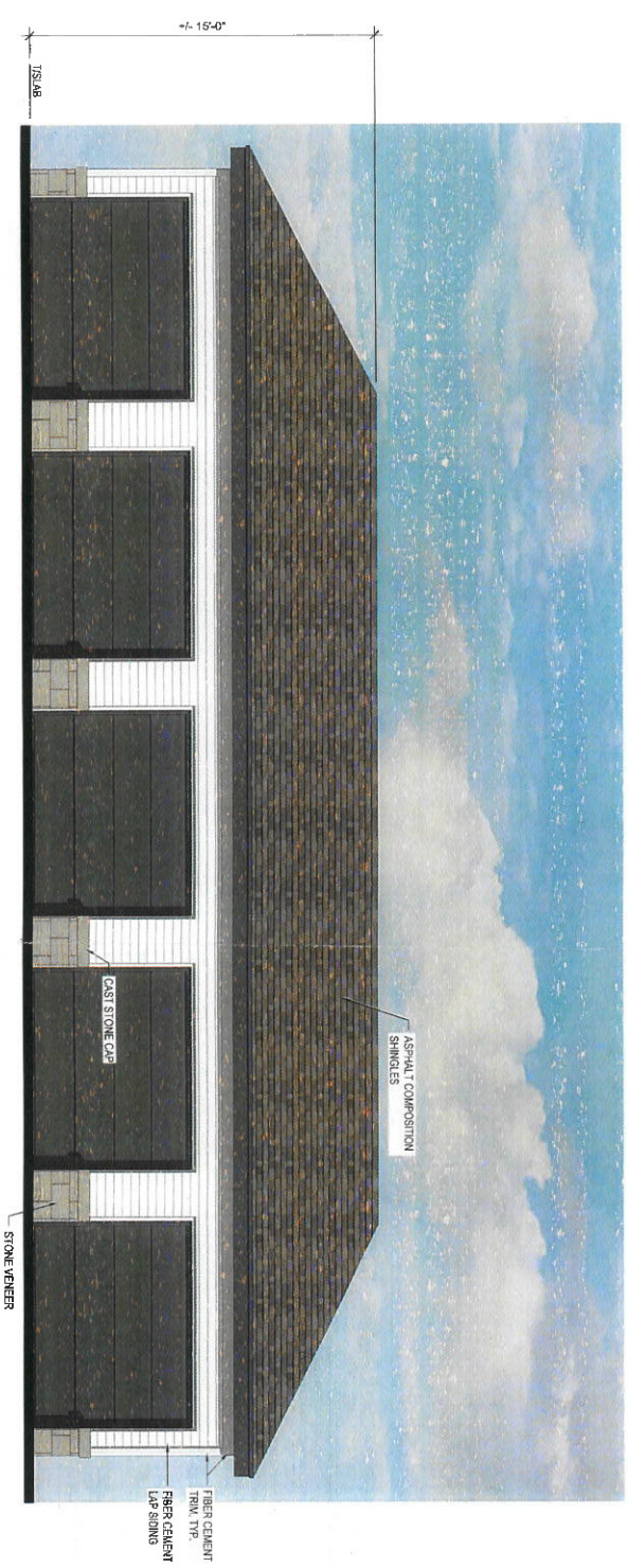
1 1/4" = 1'-0" EXTERIOR ELEVATION DETACHED GARAGE FRONT ELEVATION