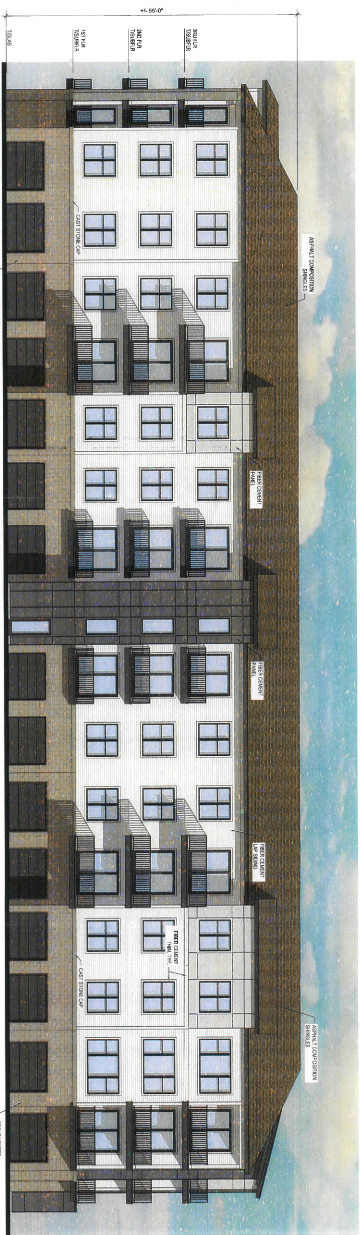
2 1/8" = 1'-0" EXTERIOR ELEVATION BUILDING C RIGHT ELEVATION