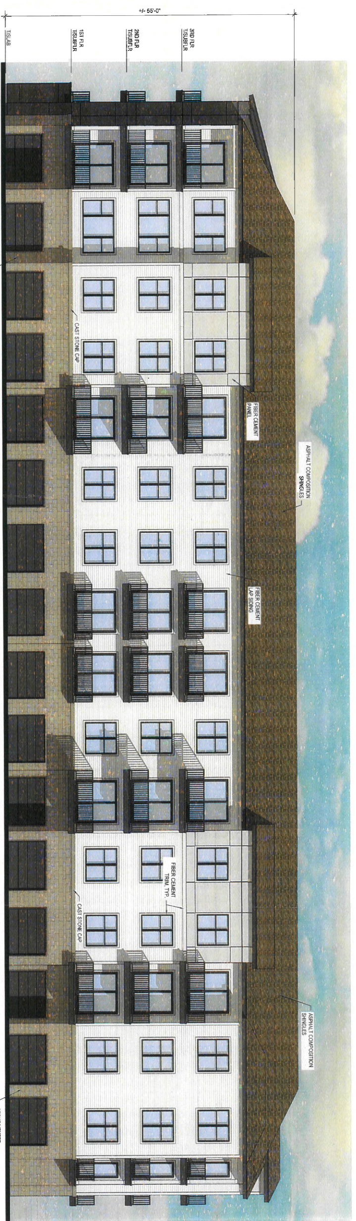
2 1/8" = 1'-0" EXTERIOR ELEVATION BUILDING C LEFT ELEVATION