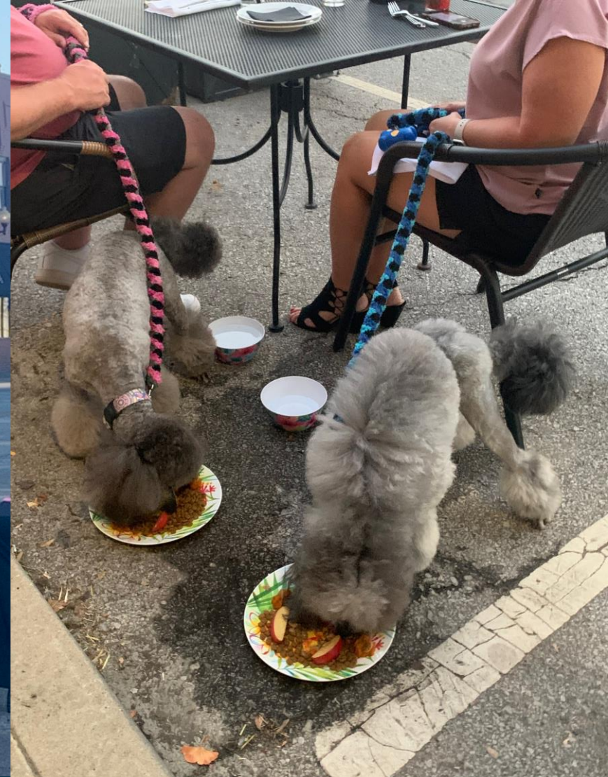
Doggie Date Night